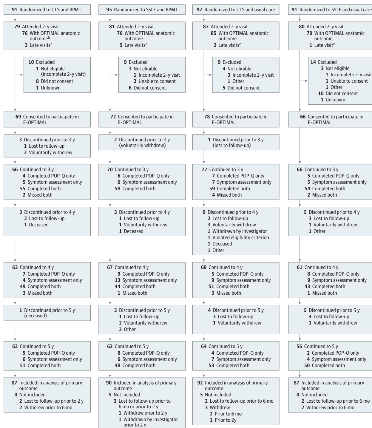
Figure 2. Operations and Pelvic Muscle Training in the Management of Apical Support Loss (OPTIMAL) and Extended OPTIMAL Participant Flow a

BPMT indicates behavioral therapy and pelvic floor muscle training; POP-Q, Pelvic Organ Prolapse Quantification System; SSLF, sacrospinous ligament fixation; ULS, uterosacral ligament suspension.